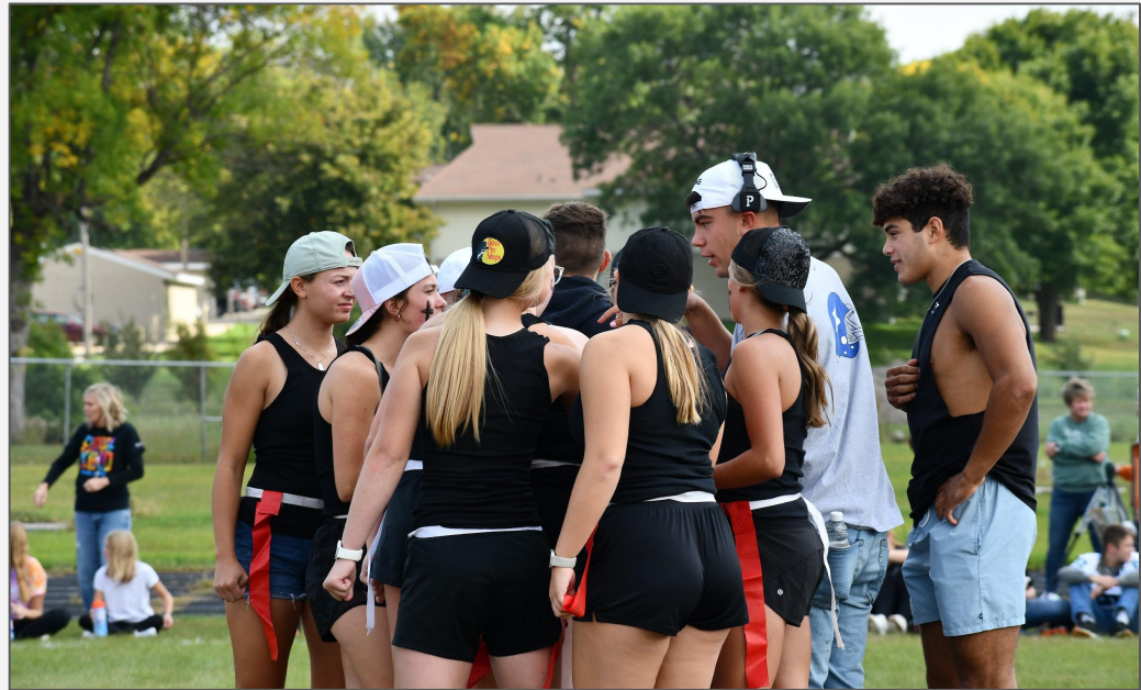
The MACCRAY senior girls took the "W" against the juniors during the Homecoming Powder Puff Game.

From coronation, to dodgeball, to volleyball and football, the student